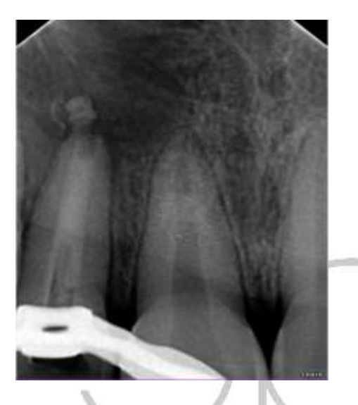
Figure 5 (Immediate post – operative view)