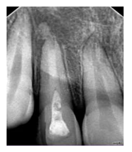
Figure 6 (Follow – up after 6 months)

Figure 5 (Immediate post – operative view)