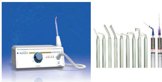
Fig 1: Ozonytron X