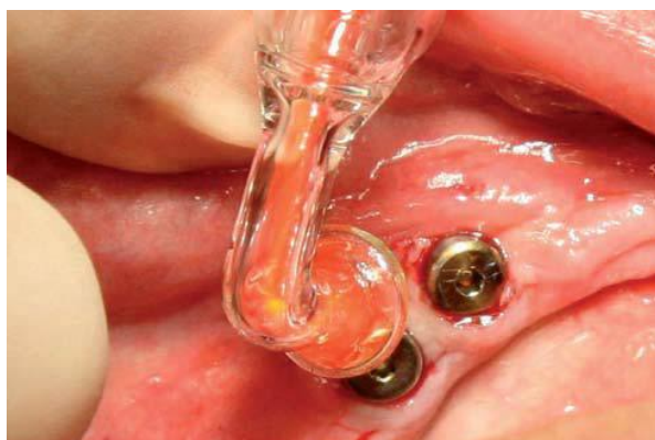
Fig 3: Ozone application in Periimplantitis

For the prevention of periimplantitis an adequate and steady plaque control regimen must be ensured. Ozone, a powerful antimicrobial kills the microorganisms causing periimplantitis. In addition ozone shows a positive wound healing effect due to the increase of tissue circulation. Gasiform ozone or ozonized water shows an increased healing compared to wound healing without ozone therapy. (Karapetian VE et al. , 2007).