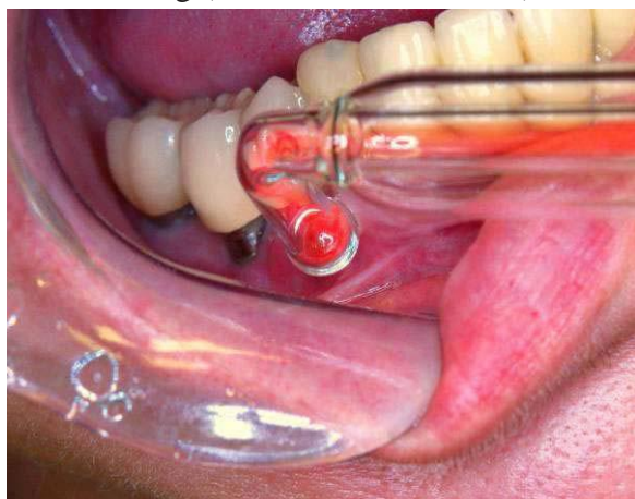
Fig 4: Ozone Application During Implantology

resistance and T-cellular immunity, thus accelerating clinical cure and reducing the incidence of complications (Agapov VS et al. ,2001). Ozone therapy is also found to be beneficial for the treatment of the refractory osteomyelitis in the head and neck in addition to treatment with antibiotics, surgery and hyperbaric oxygen. (Steinhart H et al. ,1999). Ozone therapy in the management of bone necrosis or in extraction sites during and after oral surgery in patients treated with Bisphosphonates may stimulate cell proliferation and soft tissue healing (Vescovi P et al. , 2010).