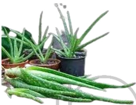
Fig.4: Aloe Vera

Biological Source: Aloe is the dried juice collected by incision, from the bases of the leaves of various species of Aloe. Aloeperryi Baker, Aloevera Linnor Aloe barbadensis Mil and Aloe ferox Miller., belonging to family Liliaceae.