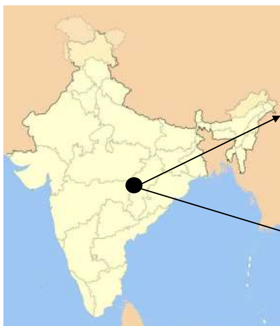
Fig.1 Location map of 18E/17 watershed

The crop water requirement (CWR) and irrigation requirement (IR) of various crops were calculated using a web based software. Relevant crop coefficients (Kc), duration of crops and cropping pattern were used to calculate CWR from ETo. These coefficients present the relationship between references (ETo) and crop evapotranspiration (ET crop) or ET\ crop = Kc * ETo . The covered area of all crops (canopy cover) was collected. The Kc